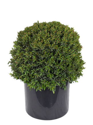
2-3 ft. Globe Eugenia