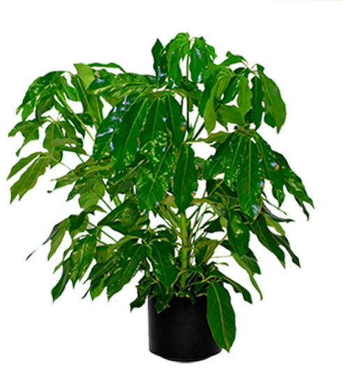
4-5 ft. Schefflera