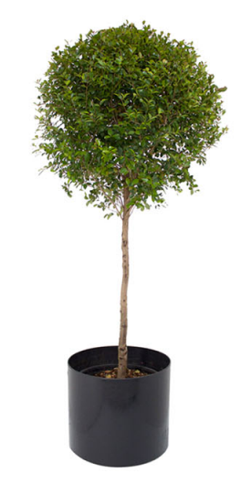
6 ft. Single Ball Eugenia