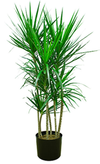
5-6 ft. Dracaena Marginata