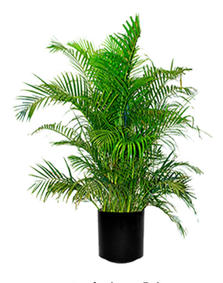
4-6 ft. Areca Palm