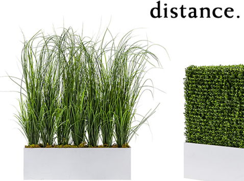
5' Prairie Grass 48" x 9" x 60"