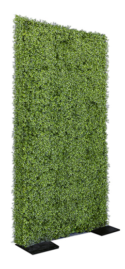
4'x8' Boxwood Wall