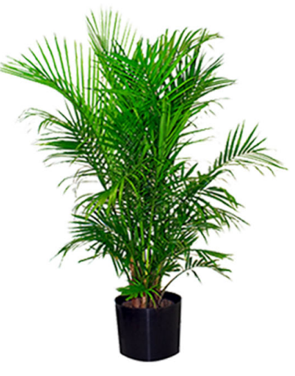
4-6 ft. Majesty Palm