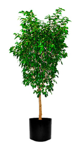
6-7 ft. Ficus Tree