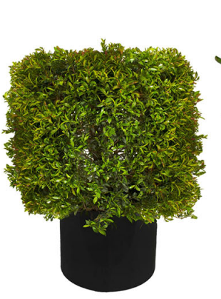
2-3 ft. Square Eugenia