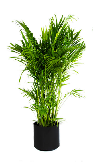
4-6 ft. Cataractarum Palm