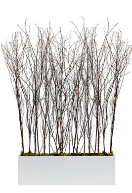
5' Woodland 48" x 9" x 60"