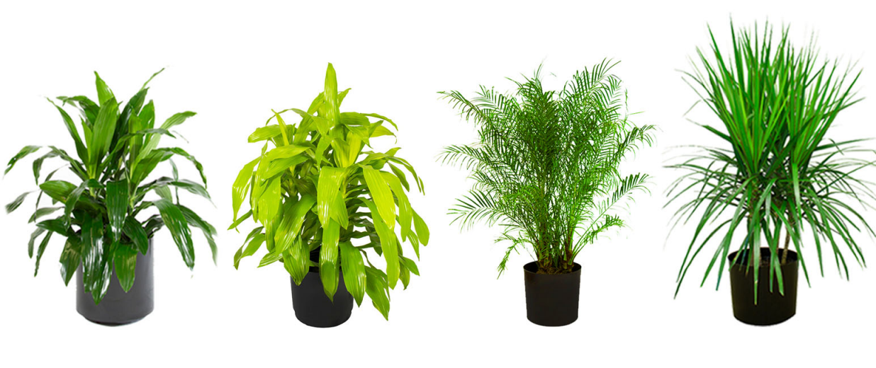
3 ft. Janet Craig