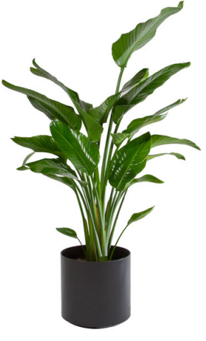
6 ft. Bird of Paradise