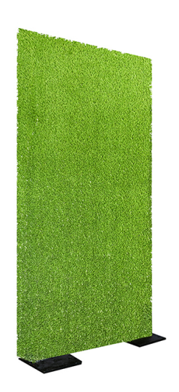
4'x8' Grass Wall