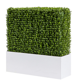
3' Boxwood Hedge 36" x 12" x 36"