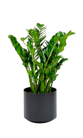
2-3 ft. ZZ