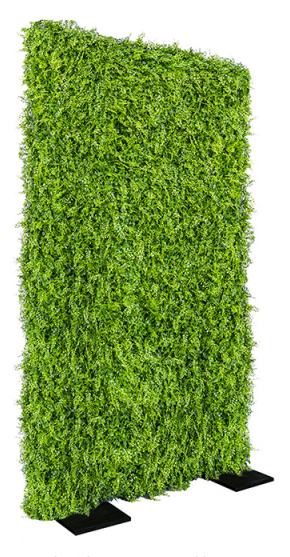
4'x8' Fern Wall