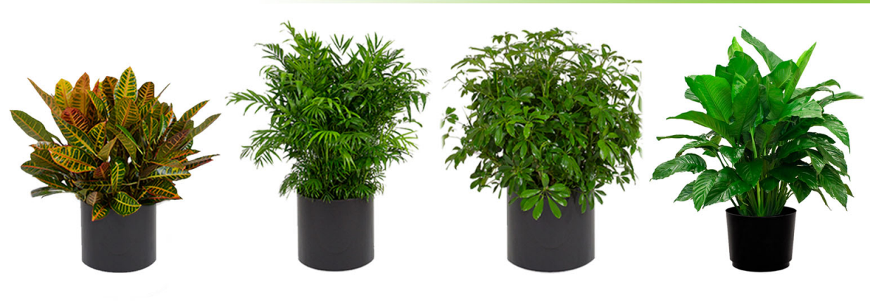
2-3 ft. Croton